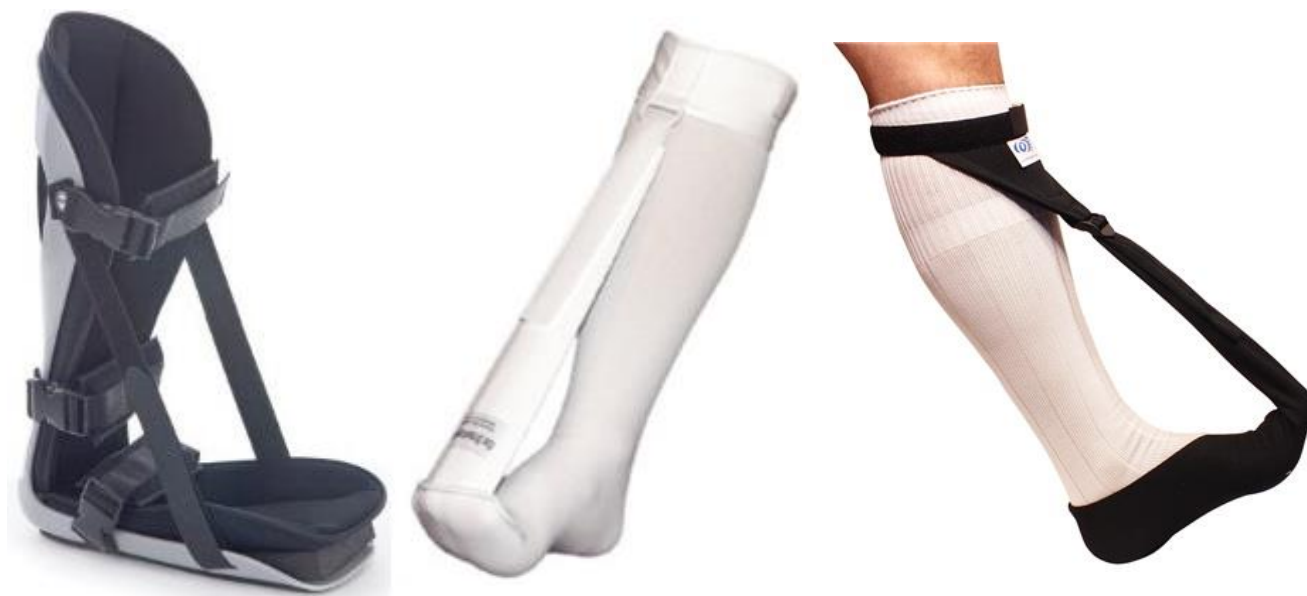
Plantar Fasciitis Night Splints