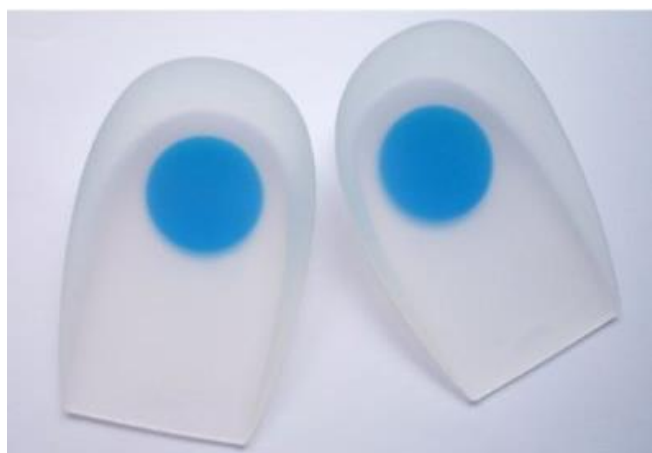
Silicone Gel Heel Cups